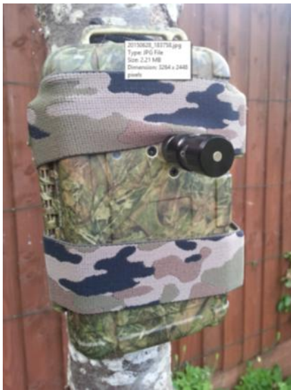
Anabat Express deployed in a garden

The project is now well under way and we have started to acquire the equipment and resources that will be needed to make the project a success. Our main objective is to record as much of the county as possible to find out which species are where and to help us identify the really important areas. Our main tool will be several Anabat